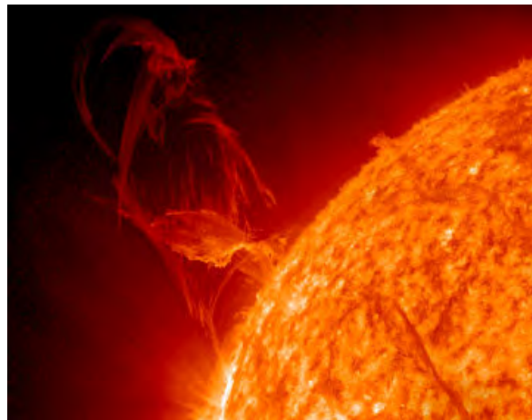
July 28 th prominence (from http://www.spaceweather.com/ )

Credit & Copyright: Alain Maury , Jean-Luc Dauvergne from link: http://antwrp.gsfc.nasa.gov/apod/ap100721.html