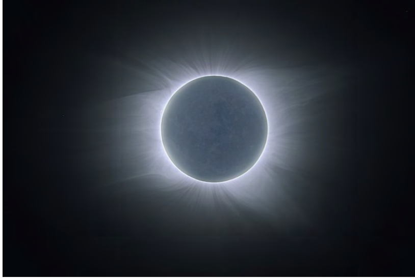
“The Crown of the Sun”

New space satellite images that I have viewed over recent months have shown plasma-like discharges from Jupiter and Venus, usually in relationship to large discharges from the Sun. As of August 1, a major solar eruption occurred that is directed toward earth. See link at NES: http://newearthsummit.org/forum/index.php?topic=64.msg4750#msg4750 . And no, Mars will not be big as the moon this month.