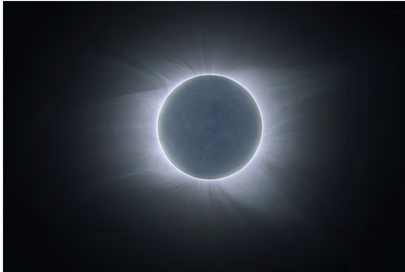
“The Crown of the Sun”

New space satellite images that I have viewed over recent months have shown plasma-like discharges from Jupiter and Venus, usually in relationship to large discharges from the Sun. As of August 1, a major solar eruption occurred that is directed toward earth. See link at NES: http://newearthsummit.org/forum/index.php?topic=64.msg4750#msg4750 . And no, Mars will not be big as the moon this month.