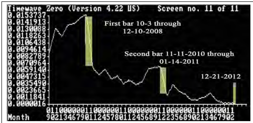
Time Wave Zero plot for present time through the end of 2012:

For more on this topic, please see the NES forums Spirituality and Transformation – Time, 2012, etc. http://newearthsummit.org/forum/index.php?PHPSESSID=f75c03d56729472e8d9a2b9b3071c742&topic=52.msg3305#msg3305 . There are also comparisons with the Half Past Human material at the link. (Note: anyone can read NES forums without signing up. Just click on any forum and you will be able to read the posts.)