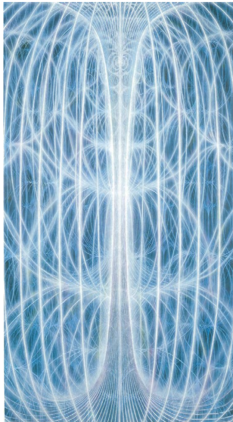
“Universal Mind Lattice“ by Alex Grey, 1981

There are also qualities of the crystalline structures within the long bones that connect to trans-dimensional states. Experiments with high coherent states that bring the body into a singular vibratory state can have by-products such as the movement through apparently solid objects. If nothing else, this has informed me that organs, bones, and blood have the capacity to transcend the “apparentness” of 3d physicality. But the poor organs have the hardest time of it since this work asks them to maintain the ordinary body and to begin feeding the higher transitional body. This is made difficult these days where there are strong disruptive energy fields from human technologies –EMF pollution is a serious problem.