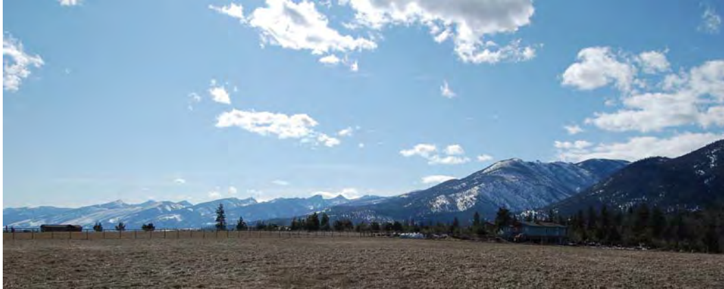
Looking South along the Bitterroot Mountains