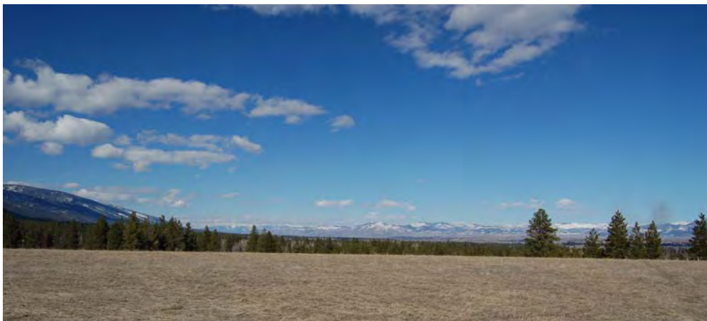
...and looking North

See website link: WWW.GNN-1.NET for details on the property.